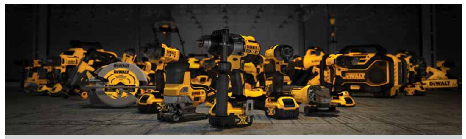
PROMOTIONS VALID SEPTEMBER 16, 2019 THROUGH OCTOBER 5, 2019 · WHILE SUPPLIES LAST